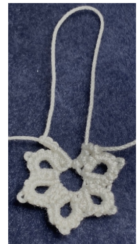
S2 thread pulled back through the picot

Next pull the core thread taught so that the S2 thread comes through the picot and forms the first half DS around the core thread. Be sure that the stitches slide correctly so the ring will close. Continue with the second half of the DS, and the remaining stitches of the split ring. →