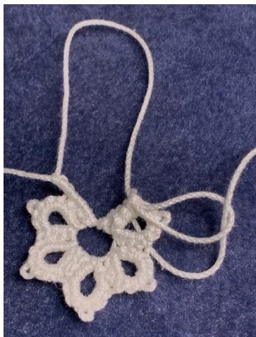
Loop of core thread pulled through the picot and S2 through the loop

Attach bracelet clasp, or for a bookmark, Finish with twisted cord and a tassel. Enjoy!